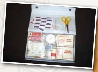
Our school really needs a First Aid Kit for when we fall and hurt ourselves. Rs. 500