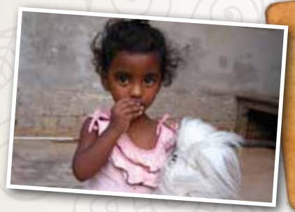
Help develop the children's artistic skills by sponsoring one year's singing and dance classes for a village girl. Rs. 7000