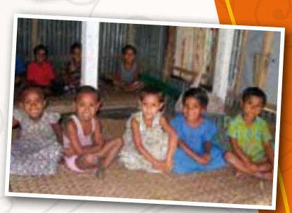
Buy a new set of bedsheets for an orphan. <u>Rs. 300</u>

One of the greatest challenges we face today is how to raise the living standards of the millions of people who live in poverty and help them to obtain a share of the world's resources.