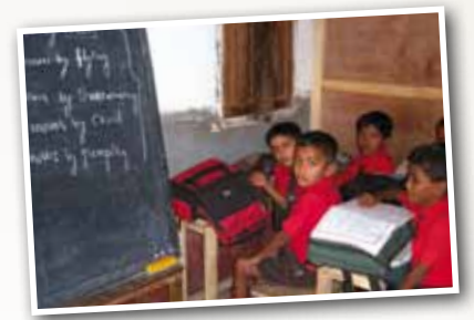
A blackboard will make learning easier. Can you give us one? Rs. 600

POOR is helping over 40 disadvantaged schools in rural India. Many of these schools lack the most basic facilities - blackboards, desks and benches, and teaching materials.