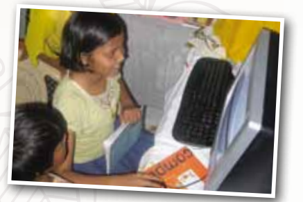
Buy a school a computer and help the children to gain a modern education! Rs. 16, 000