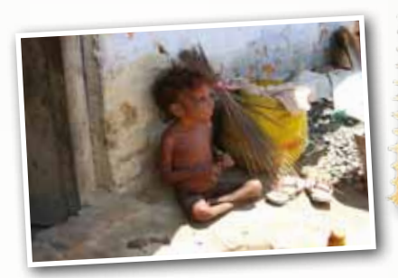
Provide nutritious food and clothes for a child for a year. Only Rs. 600 per month can keep an orphan warm and healthy.

Give an orphan a toilet set with soap box, soap, toothpaste, toothbrush, nailbrush, oil, tongue cleaner, nail cutter, comb and towel, and help him to be clean. Rs. 350