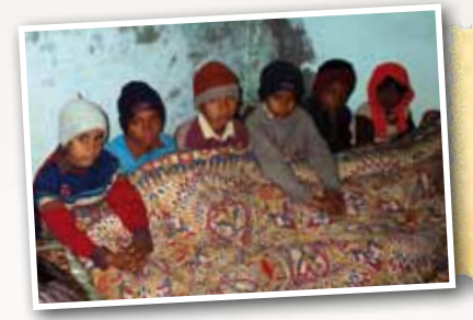
Let an orphan feel the warmth of your love by giving him a blanket. Rs. 400