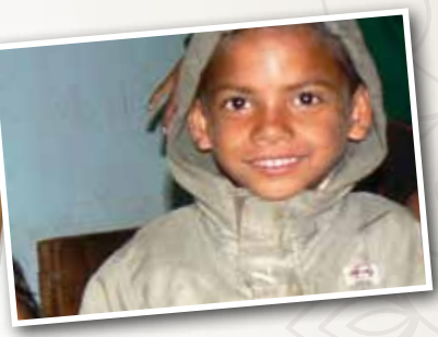
Winter no longer scares me because you have provided me with a warm jacket. Thank you! Rs. 400