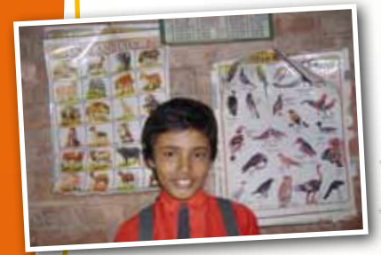
A set of wall charts will make learning fun. <u>Rs. 600</u>