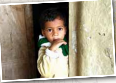
Pay for one year's education for a child. Rs. 7200