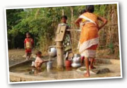
Water is life. Arrange a water connection and help us to improve the hygiene and health at our schools. Rs. 10,000