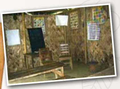
Provide a school with electricity, so the children can see properly to work on dark, cloudy days. Rs. 8000

Basic sanitation is everybody's concern. Contribute towards the construction of a school toilet. Rs. 10,000