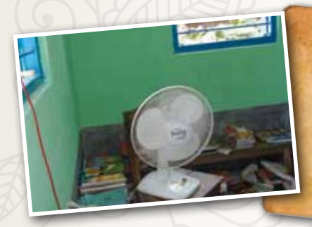
In the summer heat a fan helps to keep our brains cool, so we can concentrate. Please buy us one. Rs. 1200

Let us turn the world into one big happy family by helping those who are struggling to do so!